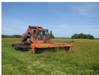
Fig 9 On wetter parts a piste machine cuts the grass and strings it together.

After the restoration period mowing of the grass was started (Fig 9, 10 and 11). To mow the grass a period with low water and no rain is required. The time for cutting the grass will be different every year depending on the water table. It is not possible to hire a company under these circumstances. The county administration board in Örebro has included machinery for mowing in a LIFE project that started 2012.