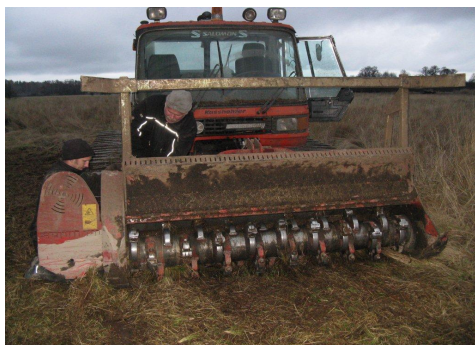
Fig 3 Cultivator on a piste machine

Primarily restorations were carried out where bushes and tussocks were cleared away from the wet meadows. Piste machines were used as a carrier of a cultivator giving a very low pressure on the ground. The cultivator pulverizes the wooded material as well as its roots and organic material and soil in the tussocks (Fig. 3 and 4). It was not possible to use tractors, even with double wheels, on the wetter parts of the wet meadows.