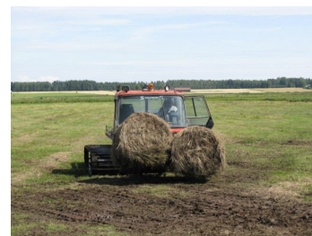
Fig 11 A piste machine with spears in front moves the bales from wet areas to the edge of arable fields.