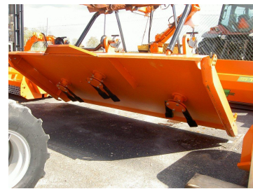
Fig 8 A cutter also can be used.

After the restoration period mowing of the grass was started (Fig 9, 10 and 11). To mow the grass a period with low water and no rain is required. The time for cutting the grass will be different every year depending on the water table. It is not possible to hire a company under these circumstances. The county administration board in Örebro has included machinery for mowing in a LIFE project that started 2012.