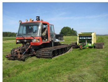
Fig 10 A big baler collects the grass