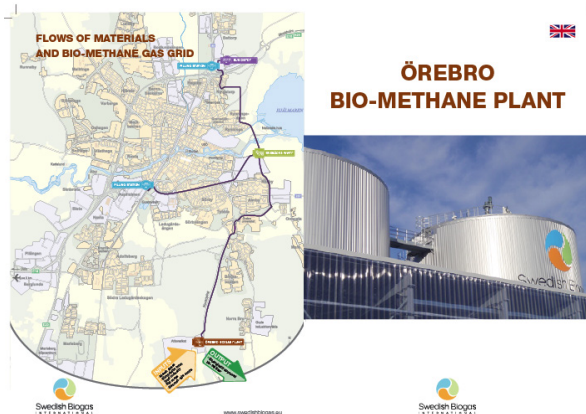
Fig 12 Plan of the biogas plant in Örebro. The biogas is used for busses running in the city.