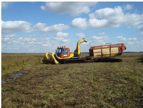
Fig 15 Retrak in Poland