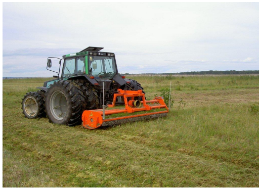
Fig 5 On dryer parts of the wetland a tractor, equipped with double wheels, is used to prepare the ground.

years to prepare the ground without collecting any biomass at all. On dryer parts it may be possible to use an ordinary tractor with double wheels to prepare the ground (Fig 5).