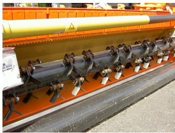
Fig 6 A flail mower was used to prepare the ground.

On wetter parts of the wet pasture it may be necessary to trim the vegetation with machines more or less every year. Still, some years it is not possible to trim the vegetation because of a too high water level. Therefore it is even more important to trim the vegetation all the years it is possible (Fig 6, 7 and 8).