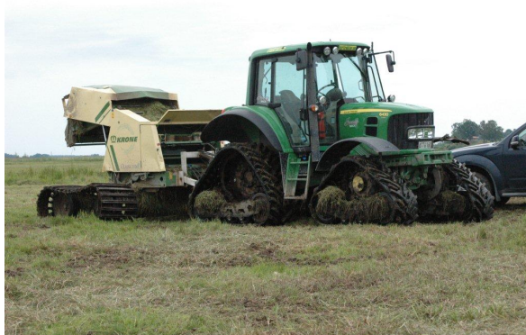
Fig 14 Tractor with track units, which reduce the pressure on the ground.

expensive machinery for harvesting the wetland grass. A tractor can be used in farming when it is not used for work in wetlands. The experiment failed because the tractor broke through the root layer. It was very hard to lift the tractor up on more solid ground due to the track units digging the tractor deeper and deeper into the ground.