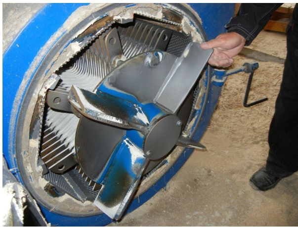
Fig 17 A Fransson FRP mill

The processing starts with cutting the bales with a cutter. The grass is then transported to a FRP mill (Lars Fransson) (fig 17), which can fragment the straw to various sizes depending on the size of the grid. After fragmentation the straw is transported to the pellet machine and made into pellets. The pellets for burning are ready to use. The process has been working for many years and works very well as far as the manager of the factory told us. The constructor of the mill later concluded that it is important that the straw is dry, otherwise the material will fill up the grid and the process will stop.