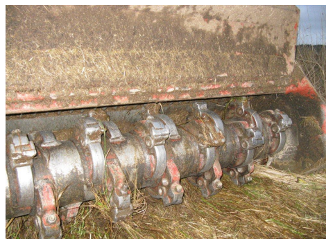
Fig 4 Cultivator, detail

The year following the first restoration a trial to harvest the grass was carried out, without success. The reason was that the ground has to be very flat and that there were still roots, branches and twigs causing problems when collecting the biomass. The quality of biomass was too low because of contamination of soil and wooded material. The conclusion from this was to use the two first