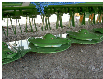
Fig 7 A towed disc mower is efficient before collecting the grass.