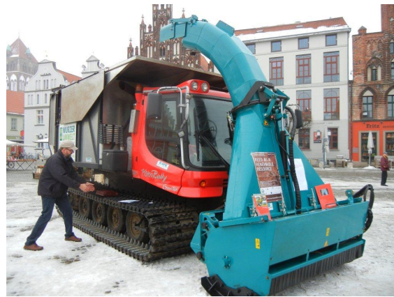
Fig 16 Piste machine with cutter and collector